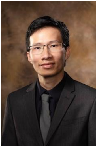
Talk Title: Precognition: Seeing through the Future