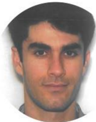
Talk Title: Efficient data collection and sequential decision making